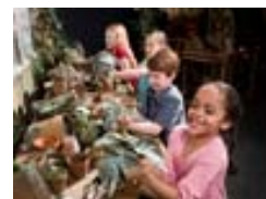
Harry Potter Exhibition