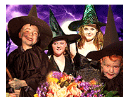
Wizard of Oz Show

Signing in and out: Any child that is not signed into the service, will not be allowed to leave the premises to attend an excursion. Care must be signed over to the service on a daily basis. All persons authorised to collect the child/ren must be over 18 years of age.