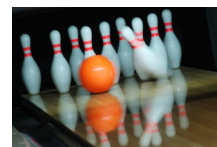
Ten Pin Bowling