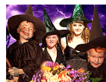
Wizard of Oz Show