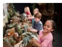
Harry Potter Exhibition