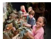
Harry Potter Exhibition