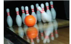
Ten Pin Bowling